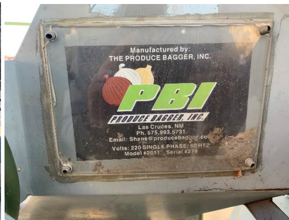
Produce Bagger 4-Head 2006